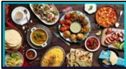
Food Stall @ Rs. 25,000/- per stall