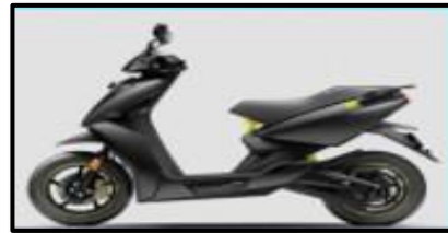
2 Wheeler – Rs 75000/-