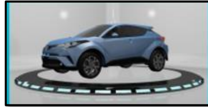
Car Display @ Main Entrance 1 Car Rs. 100,000/-, 2 Cars Rs. 175,000/-