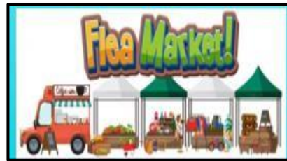
Flea Market Stall Group – Rs. 500,000/-